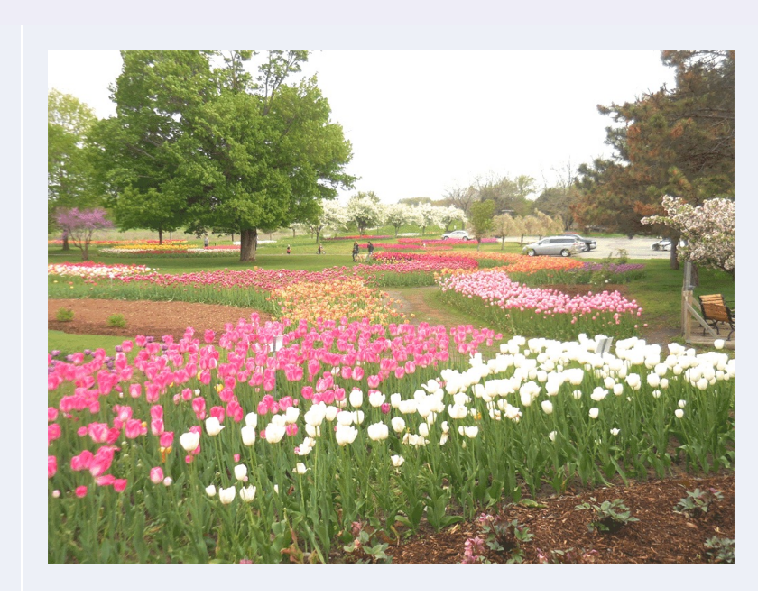
Holland, Michigan 2019