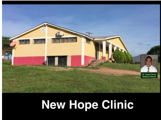
New Hope Clinic

We have a MASK-OPTIONAL policy for worship services and on-campus activities.