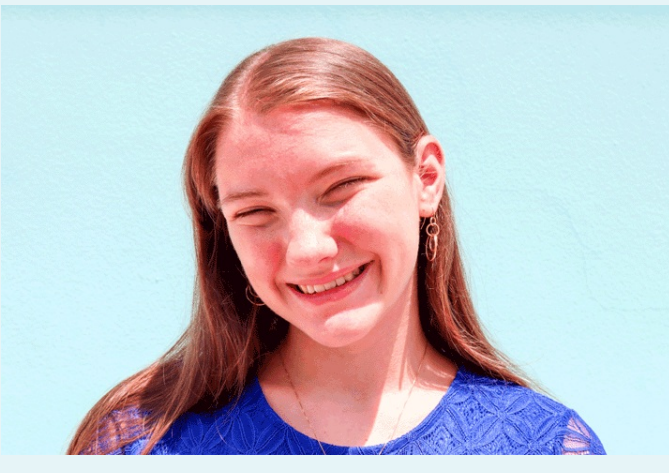
to read, sing, or go sailing.