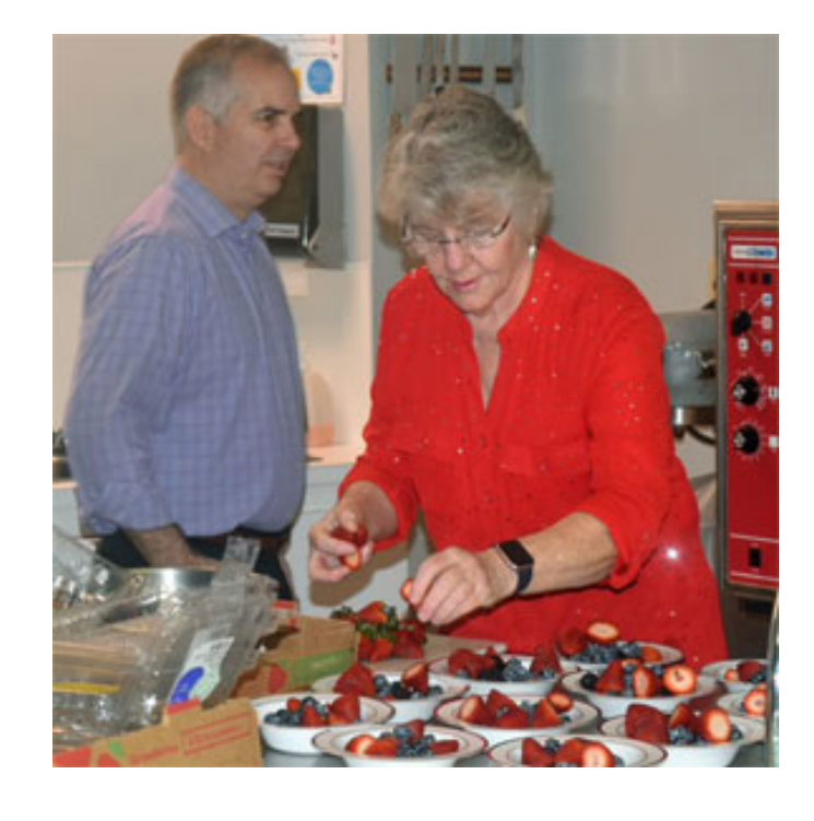
Thank You To Our Scrumptious Culinary Experts For Preparing Delicious Food