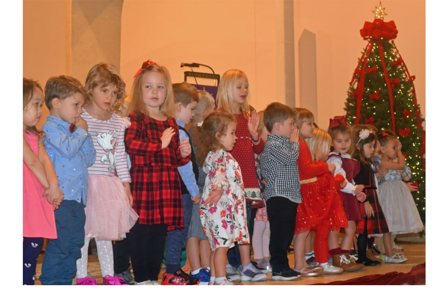
Day School students shared Christmas carols