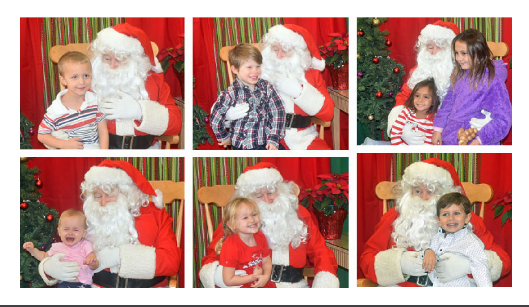
Visit From The Jolly Old Elf