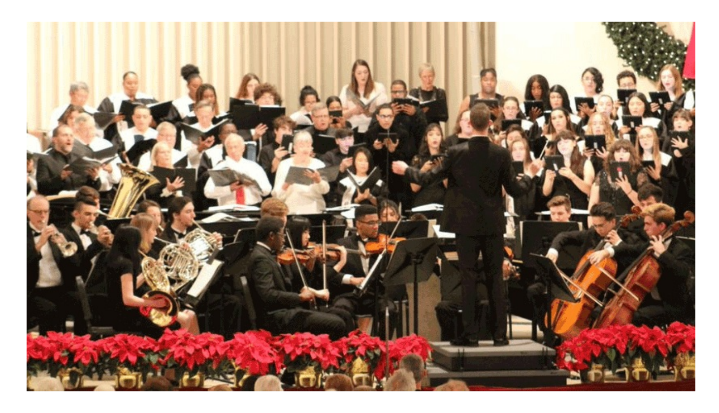
<u>Here</u> are details of the remaining performances in the Concert Series.