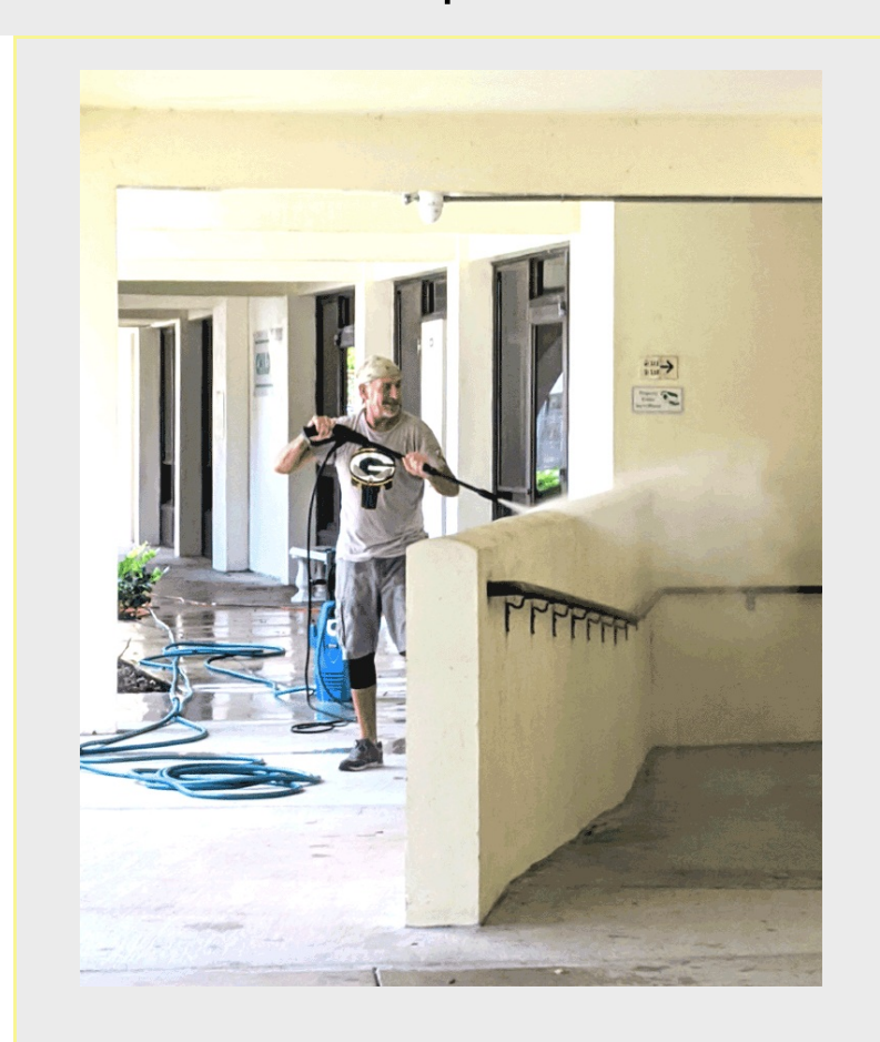
Johnny "THE MAN" has pressurewashed the entire property

Upgrades & cleaning the church campus in preparation for your return continues, & we know you will be impressed when that glorious day arrives!