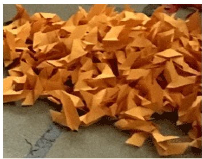
Paper doves have been folded, strung, and hung to be part of the mobile!